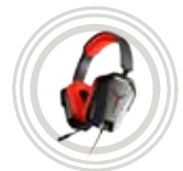
Y Gaming Stereo Headset

* Example of Lenovo Legion catalogue naming convention