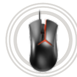
Y Gaming Optical Mouse